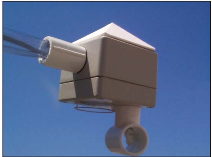
260-700 Ultrasonic Snow Depth Sensor